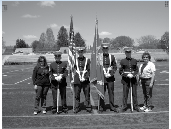
Attending the mini Relay for Life at Nazareth Area High School