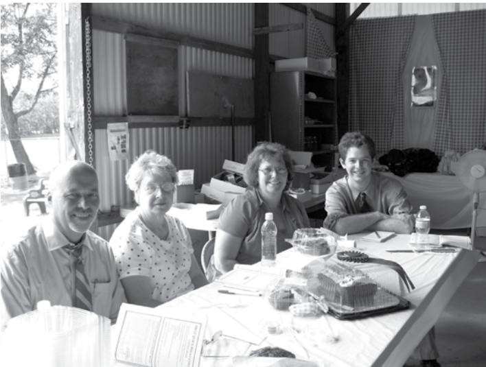
Judging at the Plainfield Farmer's Fair