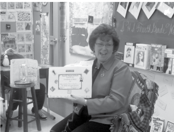
Reading to students at Sacred Heart School in Bath