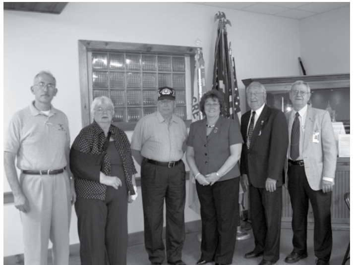
Our veterans town hall meeting at American Legion Post 470 in Bath